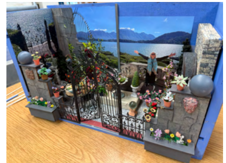
Meg's Lake Como box