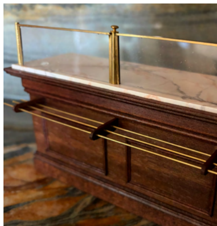
Rhona needs a special pin for her shop counter