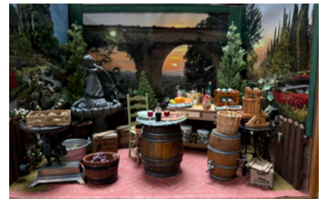
Meg's Tuscan winer box