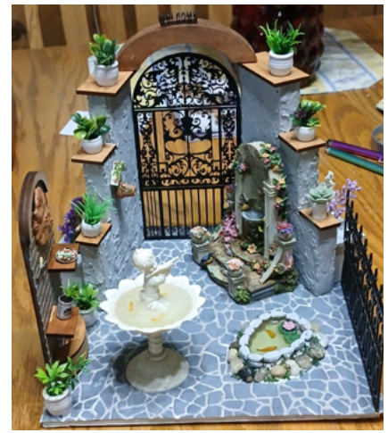
Diane's NAME Day courtyard