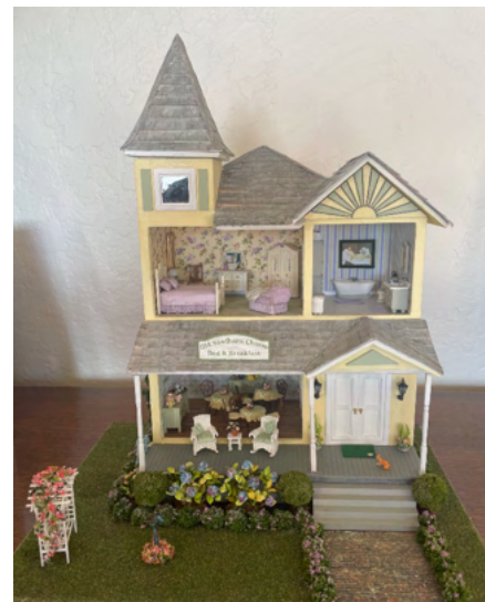
Laura's Bed and Breakfast