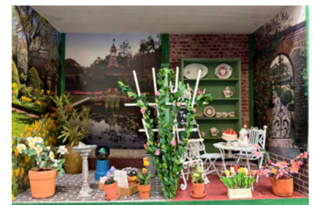
Flowers are abloom in Meg's Filoli box