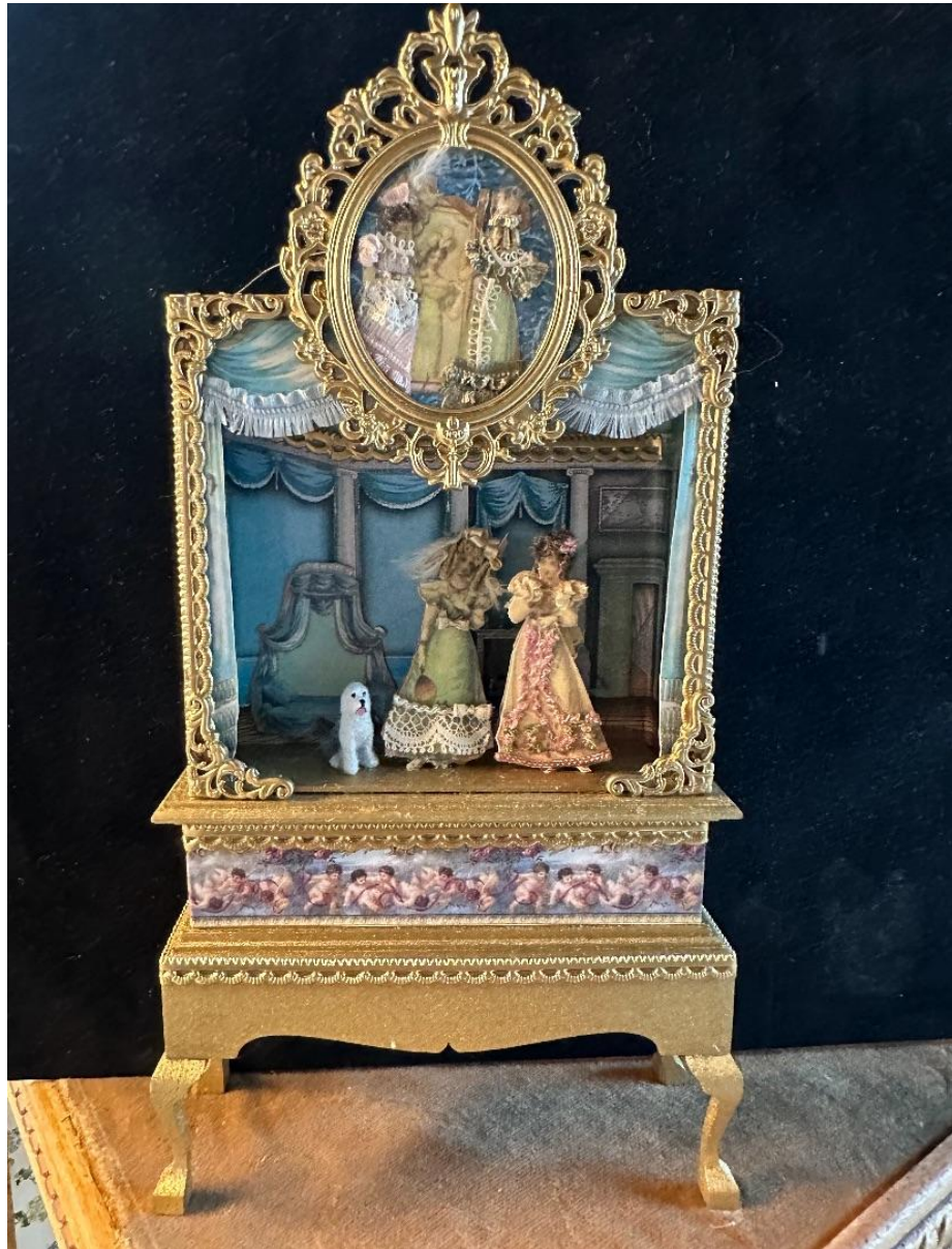
F6 – Victorian Stage by Pat Boldt Class Fee: $142

Dog by Barbara Meyer is NOT included. Please visit Barbara's table in the salesroom to purchase your favorite dog.