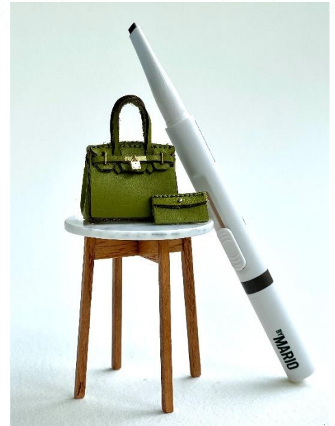
Table for display only and not included in class!