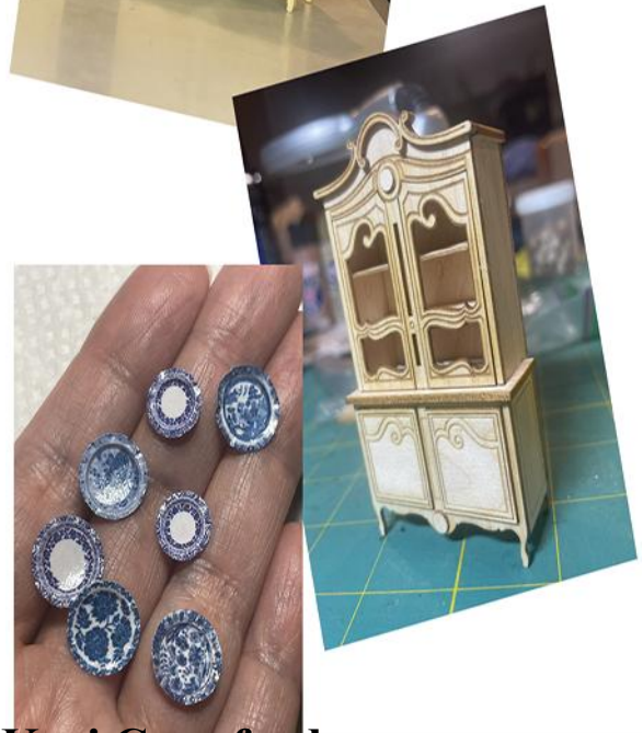
TH5 – Monet's Hutch by Kari Crawford Class Fee: $79

The painter Monet loved this style so much that there are several hutches like these in his farmhouse in Giverny, France. His are painted yellow and house his blue willow plate collection. You will assemble this maple laser-cut kit, paint it, and make your own blue willow style plates from coated paper pressed in a 3D plate press. The plate press is yours to keep for your next project. The finished size is approximately: 2" x 5"