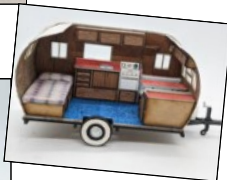
W4 - "Canned Ham" Travel Trailer by Dia Crisey-Baum 1/4" Scale • $164