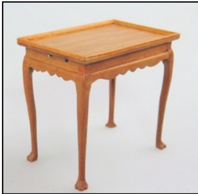
T1 - Tray-Top Tea Table by Shannon Moore 1" Scale • $94

1 Day Workshop • Tuesday 8:00 a.m. - 5:00 p.m.