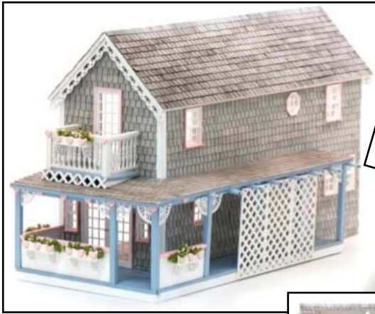
MT1 - Birdhouse Bluff by Ruth Stewart 1/4" Scale • $295

2-Day Workshop • Monday & Tuesday • 8:00 a.m. - 5:00 p.m.