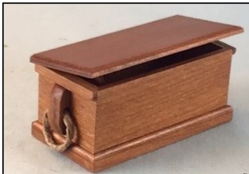
W2 - Sea Chest by Pam Boorum 1" Scale • $104