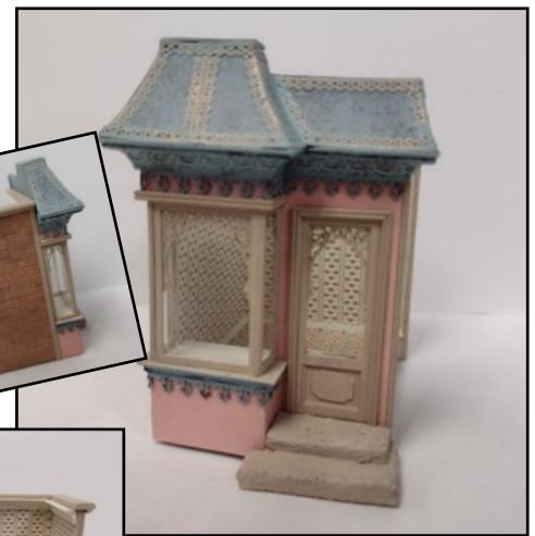
MT2 - 1/4" "Jewel Box" Shop & Furniture by Carl Bronsdon 1/4" Scale • $124