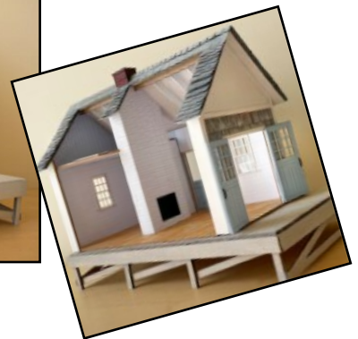
W3 - The Boathouse B&B by Carol Kubrican 1/4" Scale • $190