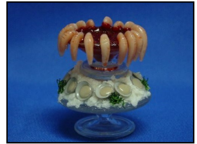
T2 - Lobster Salad & Shrimp and Oyster Party Stand by Carolyn McVicker 1" Scale • $124

1-Day Workshop • Wednesday 8:00 a.m. - 5:00 p.m.