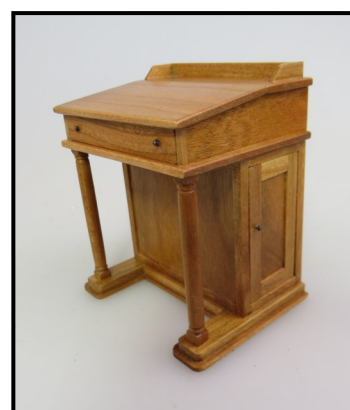
M1 - Sea Captain's Desk by Shannon Moore 1" Scale • $114