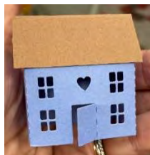
Make-n-Take Mini House and Donuts