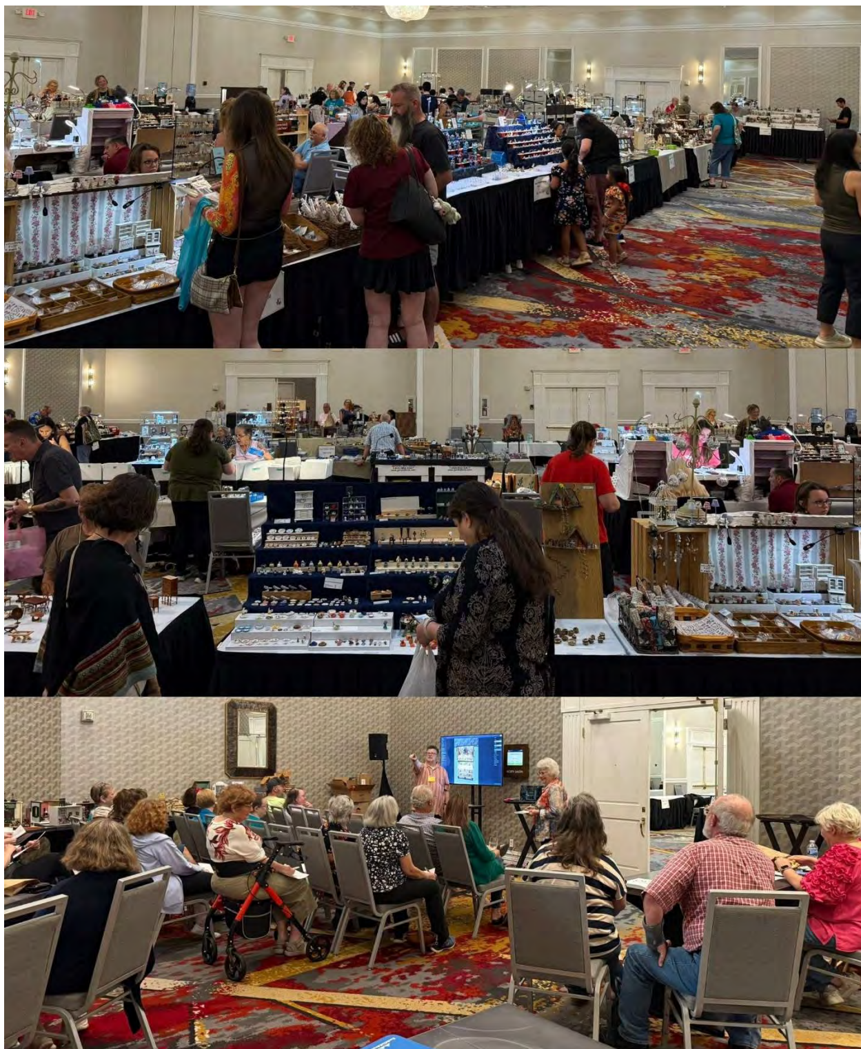
Two pictures of the Salesroom and the Live Auction for the benefit of Cook Children's Medical Center