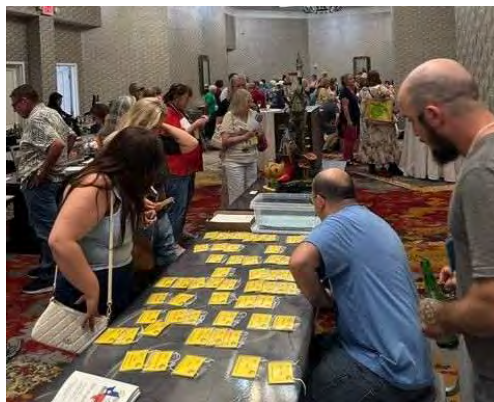
Check In and Exhibits