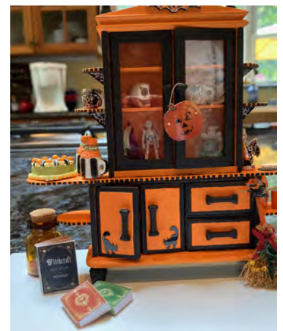
Lynn Elliot's Halloween Display