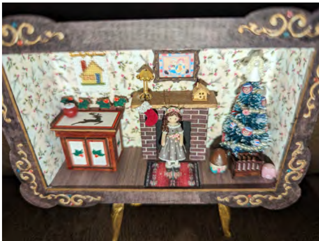
Laura's roombox on a gold 1" scale table

SR for Sacramento/Central Valley/Sierra Foothills (my goodbye as your RC)