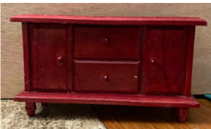
The Original Inexpensive Piece

Wee Housers: The Wee Housers members continue to work on their on projects. We'e hoping to have a summer meeting soon.