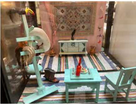
Ann Villalobos' Southwest Room Room