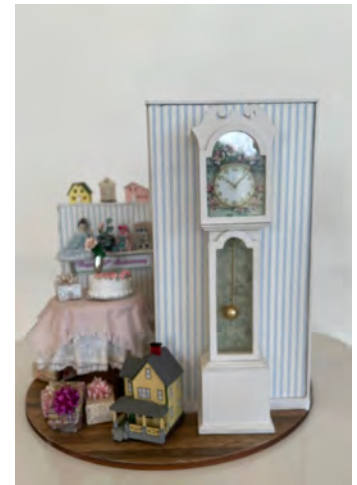
This panel features the clock. How time flies!