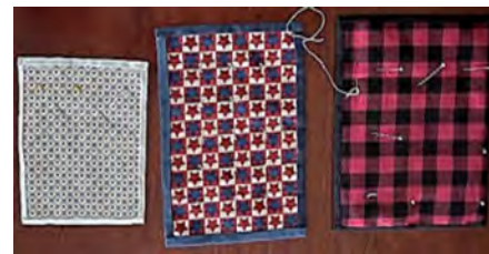
Fran Bigler taught how to make quilts for a 1" bed