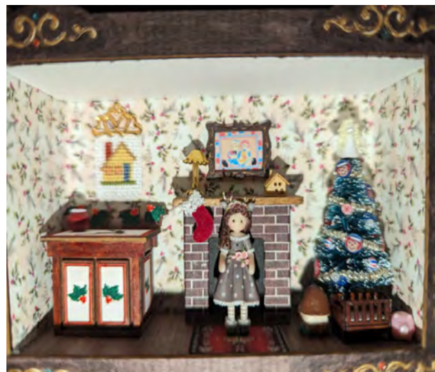
Laura's 1/4" scale roombox