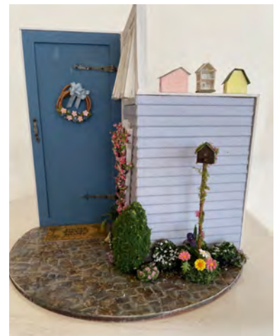
The front of Laura's NAME Day project. It is waiting for the cat to come to the door.