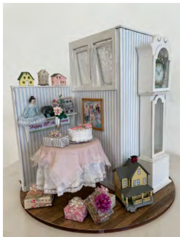
Anniversary cake and gifts