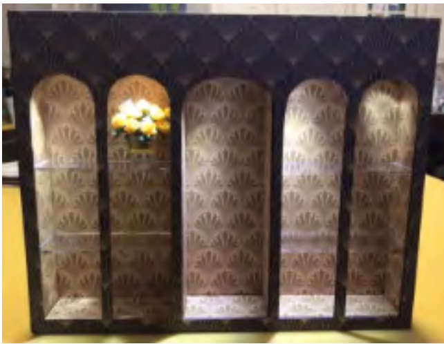
Terry Unold's prototype