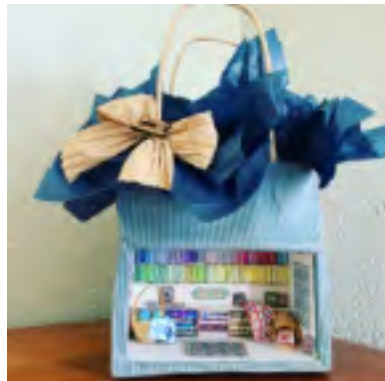
Cindy's fabric store