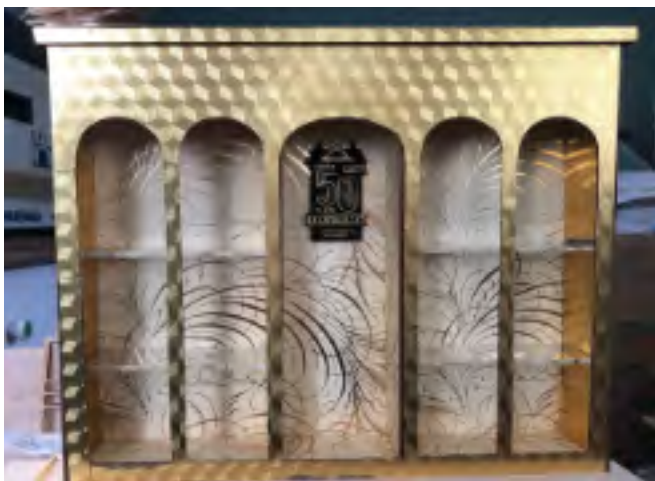
Connie Reagan's prototype with lights