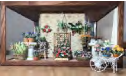
Margaret's roombox of flowers