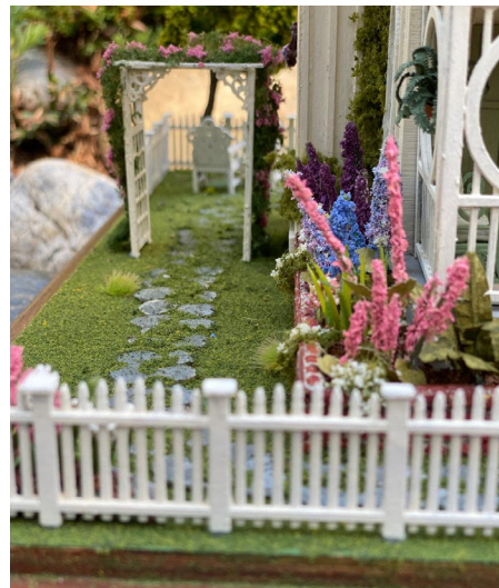
Denise's Pickett Hill exterior