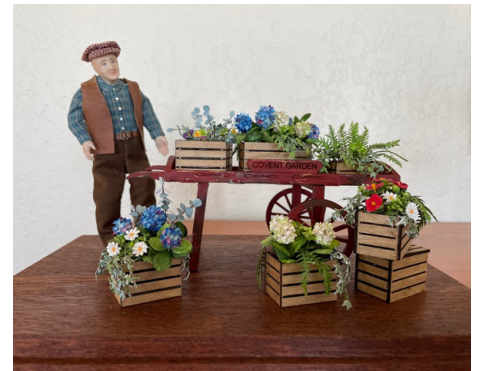
Laura's Coventry Gardens flower cart

Rhona's "Tulips in a Terra Cotta Pot," project against the backdrop of the IGMA Guild Virtual Learning Workshop prototype