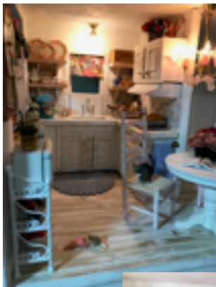
Kathy's beach house