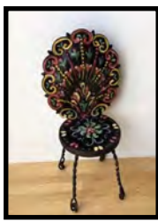
F1 - Katiya' Corner by Ginger Landon-Siegel 1" Scale • $72