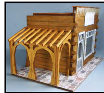
F2 - Winter Wonderland by Karen Benson 1/4" Scale • $99