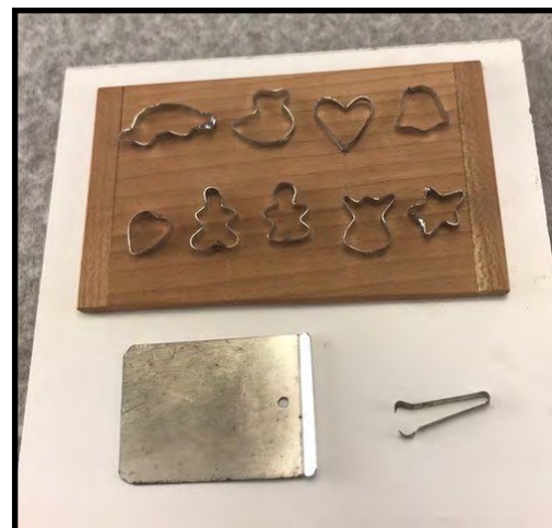
F4 - Cookie Cutters by Pete Boorum 1" Scale • $74