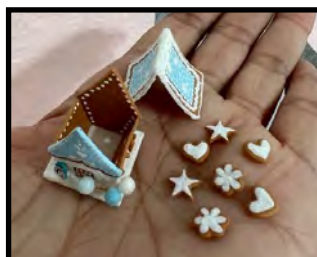
F6 - Winter Wonderland Gingerbread House by Betinha Murta 1" Scale • $144