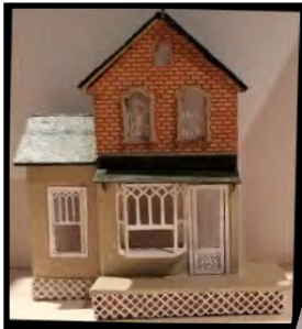
T1 - Grandma Lucy's House by Linda Tulchinsky 1/4" Scale • $129

1-Day Workshop • Tuesday • 8:00 a.m. - 5:00 p.m.