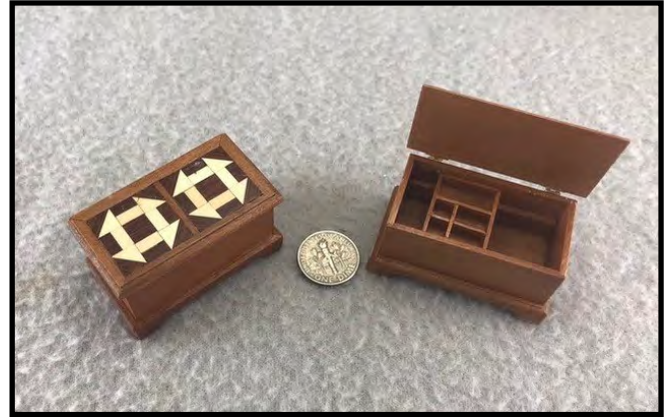
W2 - Sewing Chest with Marquetry Quilt Pattern by Pam Boorum 1" Scale • $104