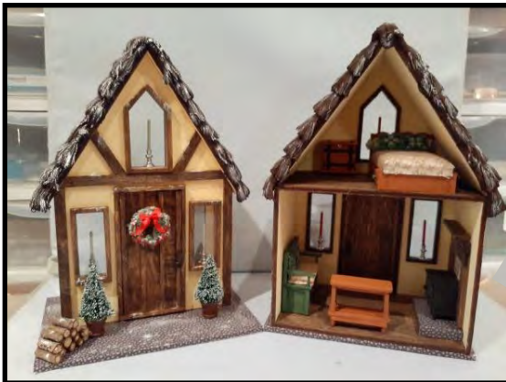
W5 - Thatched Roof Cottage by Sue Ann Ketchum 1/2" or 1/4" Scale • $164