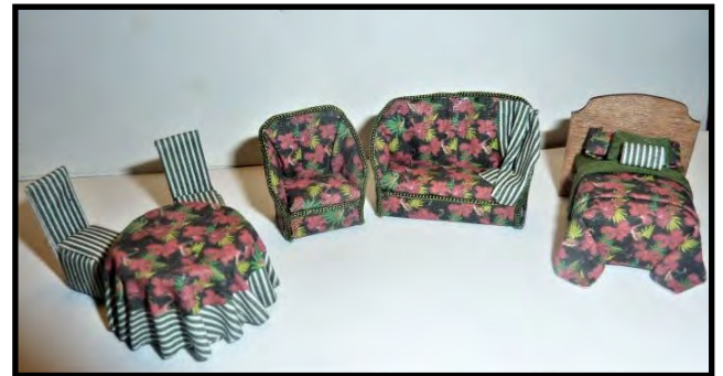
W4 - Furnishing your QS House by Cindy McDaniel 1/4" Scale • $44