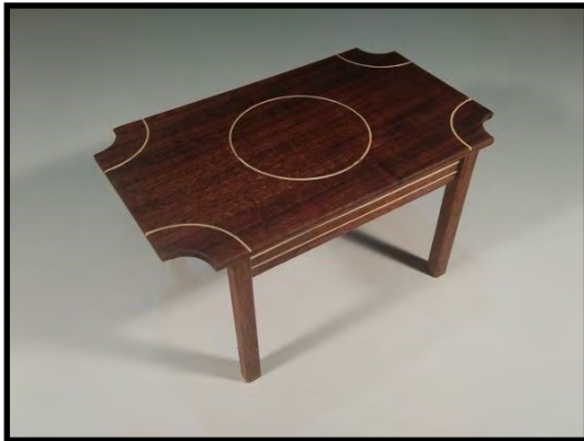
W3 - Magic of the Drill Press-Beginner by Tom Walden 1" Scale • $150