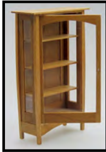
M1 - Arts & Crafts China Cabinet by Shannon Moore 1" Scale • $114