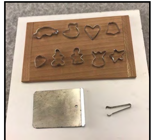
F4 - Cookie Cutters by Pete Boorum 1" Scale • $74