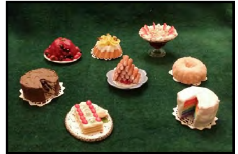
T2 - Assorted Desserts by Carolyn McVicker 1" Scale • $104

2-Day Workshop • Tuesday & Wednesday 8:00 a.m. - 5:00 p.m.