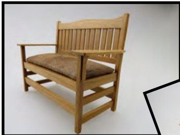
T3 - Arts & Craft Settle by Shannon Moore 1" Scale • $99

2-Day Workshop • Tuesday & Wednesday 8:00 a.m. - 5:00 p.m.