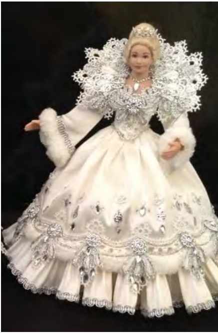
W1 - Snow Queen by JoAnne Roberts 1" Scale • $164

1-Day Workshop • Wednesday 8:00 a.m. - 5:00 p.m.