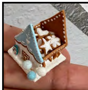
F6 - Winter Wonderland Gingerbread House by Betinha Murta 1" Scale • $144