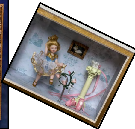
TH6 - 1-1/2" Ballerina in a Frame by Pat Boldt 1/2" Scale • $89