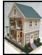
MTW1 - Bramlewood Townhouse by Kristie Norman 1/4" Scale • $409

1-Day Workshop • Monday 8:00 a.m. - 5:00 p.m.