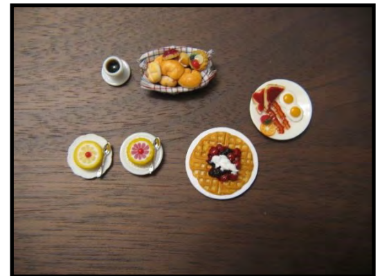
TH5 - Quarter Scale Breakfast by Carolyn McVicker 1/4" Scale • $79