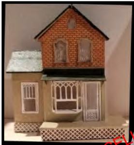
T1 - Grandma Lucy's House by Linda Fuchinsky 1/4" Scale • $129

1-Day Workshop • Tuesday • 8:00 a.m. - 5:00 p.m.