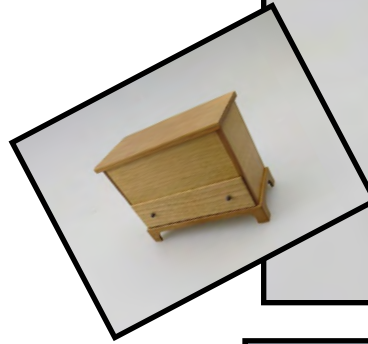
TH2 - Shaker Blanket Chest by Shannon Moore 1" Scale • $79