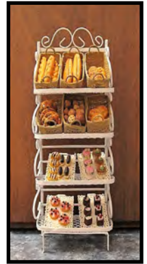
M2 - Baker's Rack w/Assorted Breads & Pastries by Carolyn McVicker 1" Scale • $124

1-Day Workshop • Tuesday • 8:00 a.m. - 5:00 p.m.