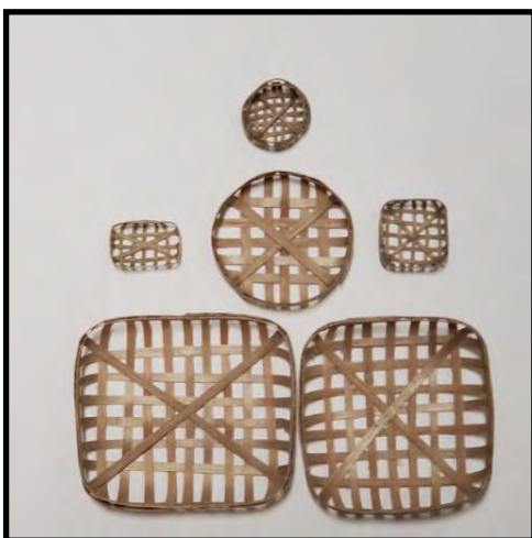
F5- Tobacco Baskets by Charrita Teague 1" or 1/4" Scale • $44