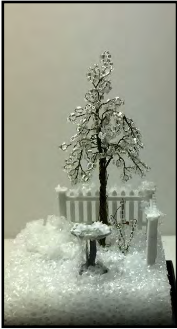
TH1 - A Winter Garden by Sally Manwell 1/4" Scale • $70

1-Day Workshop • Thursday • 7:30 a.m. - 11:45 a.m.