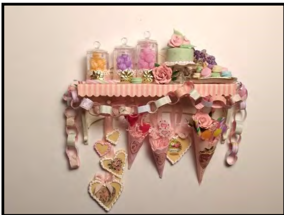
F3 - Pastel Sweet Shelf by Carl Bronsdon 1" Scale • $109