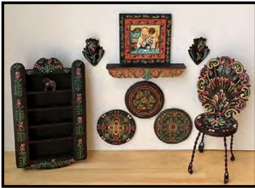
F1 - Katiya' Corner by Ginger Landon-Siegel 1" Scale • $72

1-Day Workshop • Friday 7:30 a.m. - 11:45 a.m.