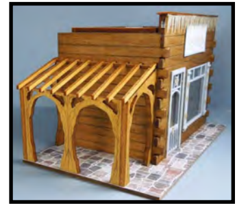
F2 - Winter Wonderland by Karen Benson 1/4" Scale • $99