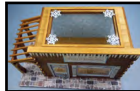
F2 - Winter Wonderland by Karen Benson 1/4" Scale • $99