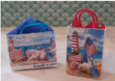
The Mini Attics sent 100 tote bag favors to the National Convention in Cape Cod.

Wee Housers: Summer has been a time of travel for some of us and a busy time for others. I'm hoping we can meet again in the fall.