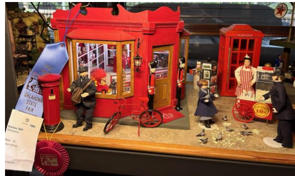
Merry Old England by Maggi Burton

To enter the competition OKC area residents simply Googled www.okstatefair.com , clicked on competitions and followed the instructions. What a wonderful way to promote miniatures in your area!