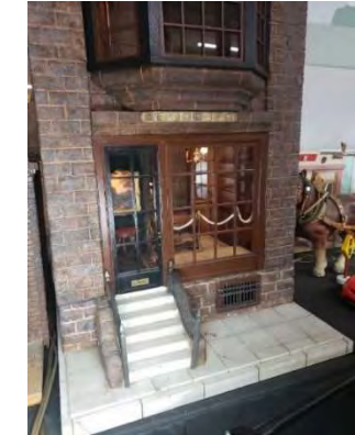
Top four photos Whimsie’s Dollhouse shop, Greenwich, CT; Lower five photos Flip This House, new Bedford, MA