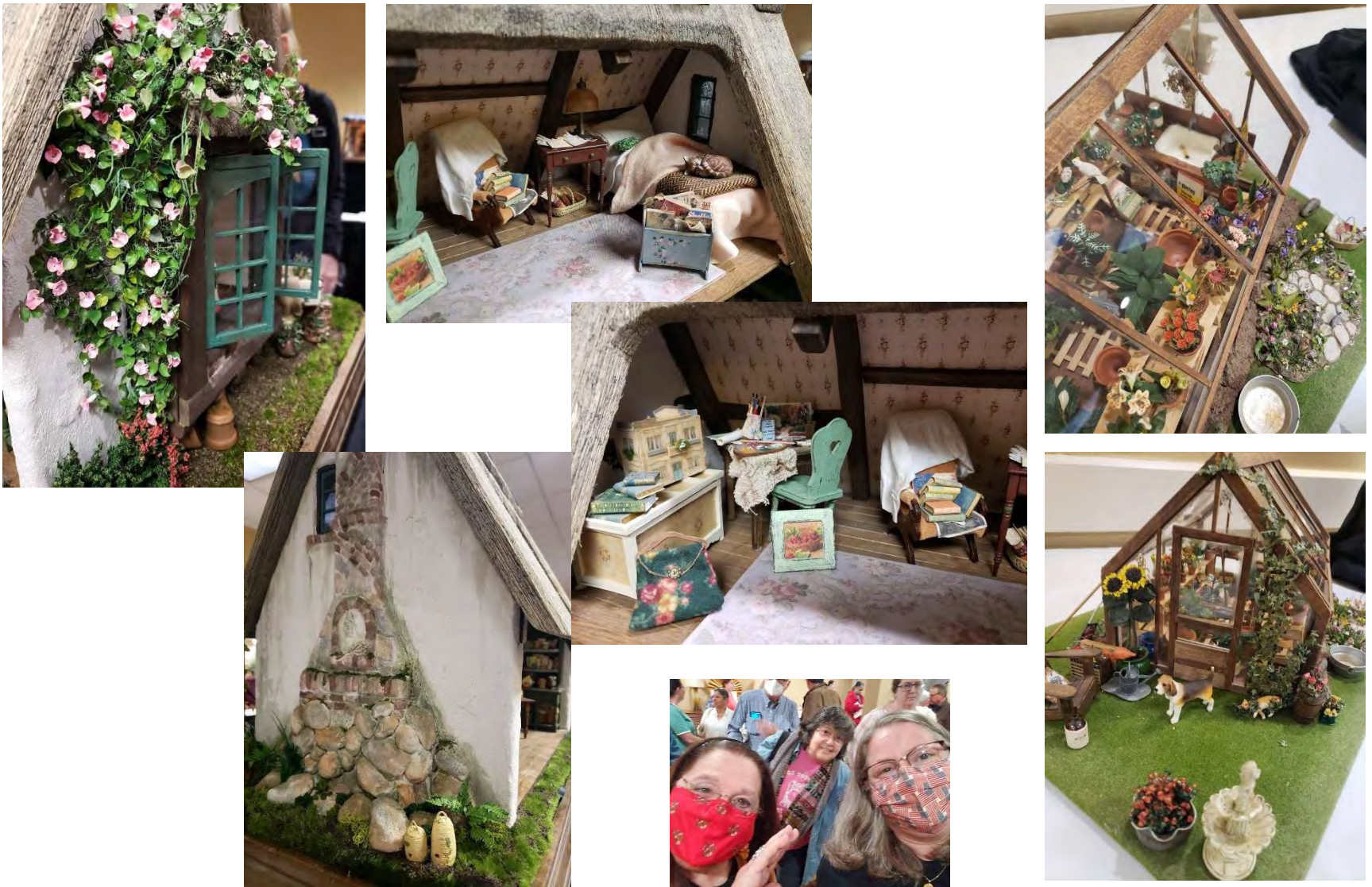
Highlight pictures from Delaware Mini Show April 2022.