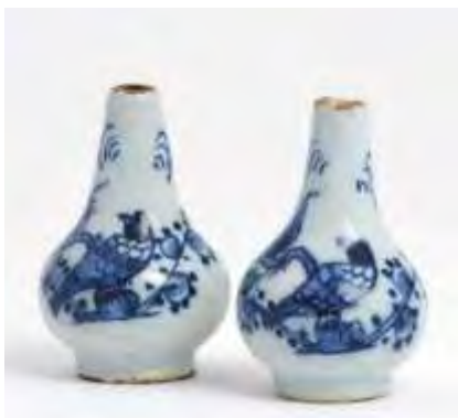
Miniature garniture of five blue and white miniature vases, circa 1765

Some secondary sources mention that apprentices had to execute miniatures as a test to obtain the title of master. However, no documents or prints from the guild materials prove this assumption. On the contrary, it has been proven that apprentices were expected to make a life-size object with perfect dimensions.