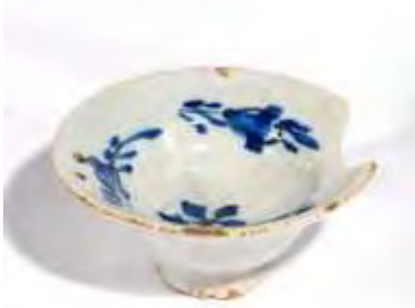
Blue and white miniature barber's bowl, circa 1740

During the Golden Age of Holland, miniatures were often sold at annual markets or kermis and were called poppegoet (doll's ware). Rapidly, they played an important social role amongst wealthy Europeans. Miniatures were distinguished by two different groups and uses. The larger groot poppegoet or large doll's wares were conceived as children's toys. The smaller miniature objects, which were called poppegoet or doll's wares, were intended to distract adults. [4] As can be seen in Sara Rothé's dollhouse, these miniatures were just as the life-size objects made of several materials, such as wood, silver, copper, glass, textiles, paintings and ceramics. During the eighteenth and nineteenth