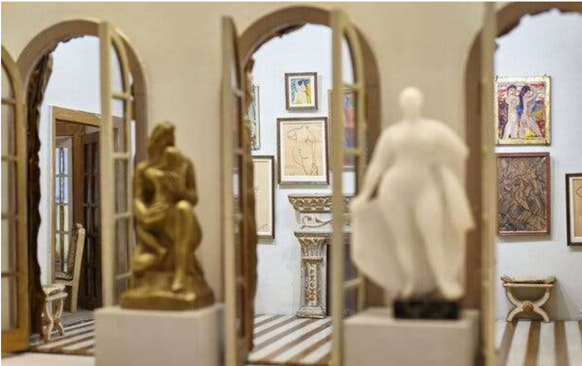
Photo: Peering into the Stettheimer Dollhouse, at the Museum of the City of New York, to see miniature world-class art, including, at right on the wall, Marcel Duchamp’s “Nude Descending a Staircase.”