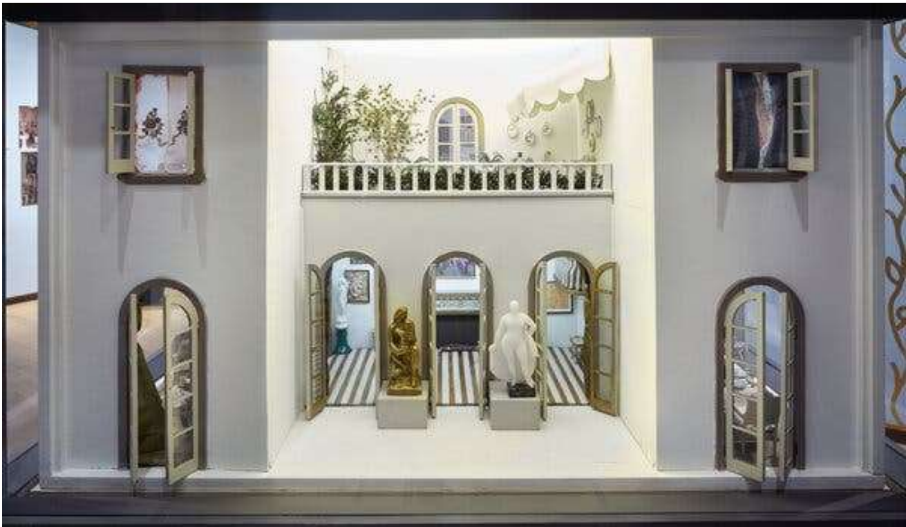
Photo: The dollhouse's art exhibition begins on the patio, with William Zorach's "Mother and Child," left, and Gaston Lachaise's "Venus."

But looking in, at least, you'll find a portrait of two dancers by the Swedish painter Carl Sprinchorn hanging above the fireplace. She, in a billowing pink skirt, does a jeté, while he, in a navy leotard, waits beside her; around them hover blocks of primary color so bright that the couple is almost obscured. Eleven more framed drawings and paintings cluster around the Sprinchorn: a mix of voluptuous graphite nudes by Lachaise; sinuous female bathers, posed against blood-red skies, by Marguerite Zorach; a sailboat confronting a great wave; a Cubist pastoral scene; Duchamp's "Nude"; and, in Louis Bouché's "Mama's Boy," a child peering between heavy green curtains.