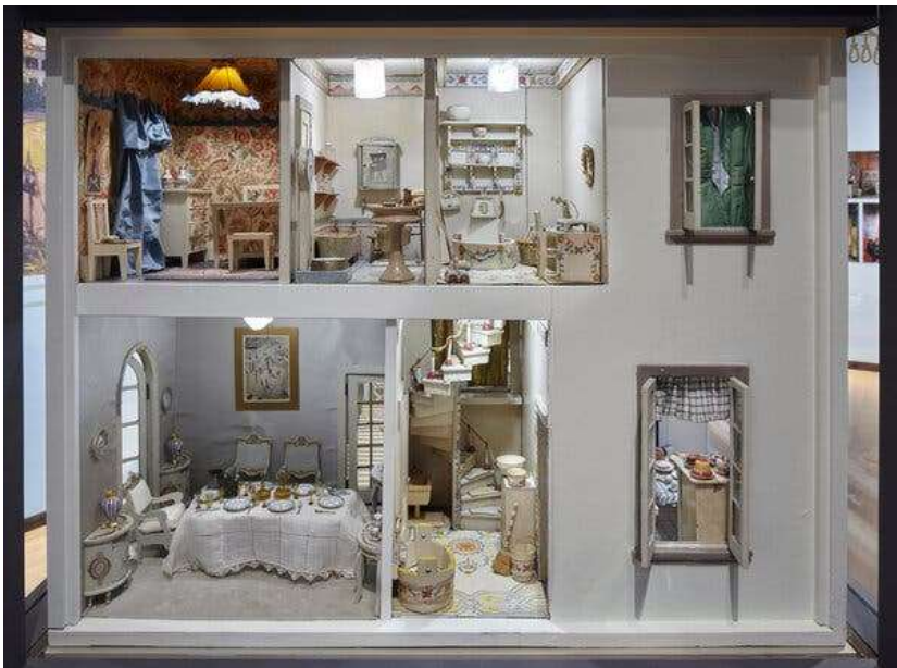
Photo: Clockwise from left: a bedroom; a bathroom; the upper part of the back stairs; a room obscured by green drapes; a view into a pantry; the lower part of the back stairs; and a dining room.

The new installation addresses these difficulties by surrounding the house with photos of enlarged interior views, along with related historical materials. It's a judicious presentation, one that makes the inviting but secretive house more accessible without stripping away its mystery, though I'd have preferred longer wall labels to QR codes. A receipt for Ettie's 1945 donation indicates that along with the house, she sent a doll, complete with a Saratoga trunk and trousseau; and Carrie shows up, in a reproduction of a portrait by Florine, as a glamorous flapper at a garden party.