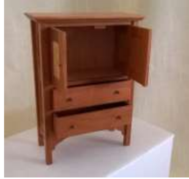
Hardwood display case for quarter scale, LED lighting kit for a 8-12 inch wide roombox or display case and real wood shingle strips pack in preferred scale Donated by Luci Hanson of Cascade Miniatures