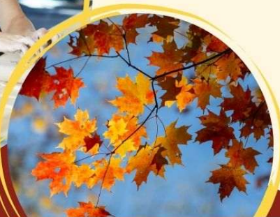
Connect with Nature

Want to spend a weekend with like-minded people and Create Miniatures? JOIN US the 2nd weekend in October