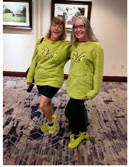
Winter Wonderland Saturday Banquet Attendees