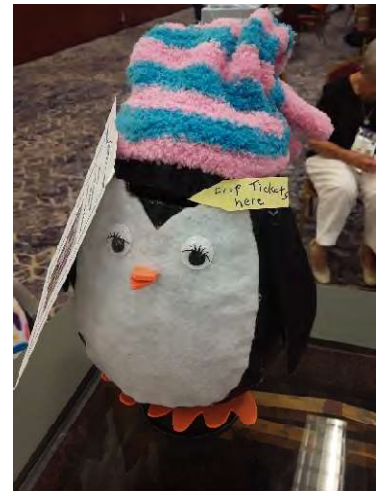
Houseparty Helper Ticket Boxes