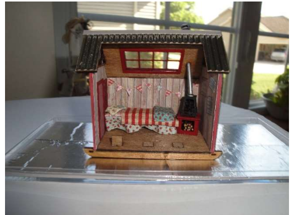
Thursday evening project for the 2022 convention.