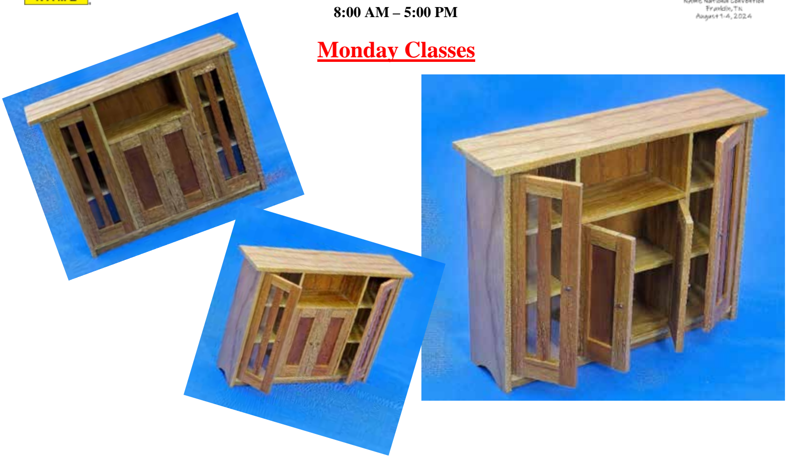
M1-Stickley Bookcase & Cupboard by Shannon Moore Class Fee $114

This piece was originally designed by G. Strickley in the early 1900's. It was intended to house books or other collectibles behind the glass doors on each side while serving as a cupboard in the open area between the bookshelves along with the storage place below the paneled doors. The design has been modified slightly to allow for taller objects to be displayed and stored. This piece would be perfect in a Bed & Breakfast, for example: acting as a server for breakfast or afternoon tea, or housing reading material in the library or den. Our model will be made from cherry with "glass" doors and center paneled doors. The pieces will be precut, but we will spend class time assembling and fitting the pieces together. The finished size is approximately: 4-3/8"L x 1-1/8"D x 3-3/8"H