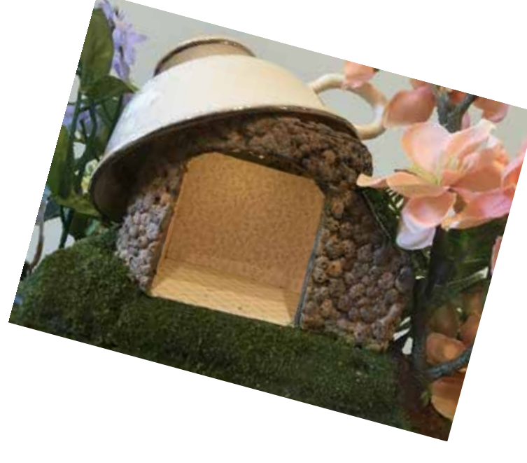
W1-Holly Pond Bed and Breakfast by Suzanne Larson-Tamburo Class Fee: $194

In this class we will translate the artwork of Susan Wheeler into a 3-dimensional mini scene, a darling little teacup covered house. In this class we will build the structure using a vintage cup. Styles will vary from what is pictured. Students will wallpaper, electrify, cut and shape foam core to create the base, and landscape. Please note that this is NOT a laser cut kit and there will be no kits available after the class. Students will need the ability to cut pieces, adjust as need be and adapt. Included in the class is a pair of Julie Stevens mice. 9"L x 9"W x 7"H