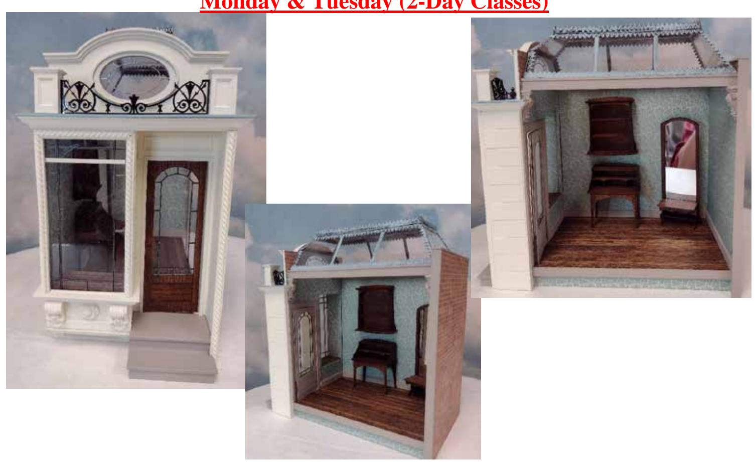
MT1 – The Trim Tailor Shop by Carl Bronsdon Class Fee: $269

A small size structure, (not small scale) designed with detailing in mind, this tiny shop, (designed as a tailor shop but could be made into a variety of other shops) is chock full of detailing. From the faux stone façade to its oval window and "copper and glass" skylight roof, it exudes charm from a century ago. Inside a small set of display shelves, a tall mirror with bench, and a shop desk with shelving appoint the interior. Learn tricks of using paper and wood trims to create the looks of stone and tooled cooper detailing. 8"W x 13"H x 12"L