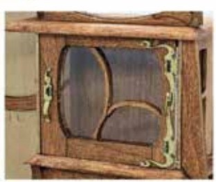
T3-Art Nouveau Vitrine by Dia Crissey-Baum Class Fee: $144

Art Nouveau furniture came into vogue in the late 19<sup>th</sup> and early 20th centuries. It was known for its sinuous curves, motion, and mimicry of the living world in materials such as wood, metal, and glass. Build this laser-cut kit from hardwood in this class, go home with an amazing piece of furniture! This is my interpretation of the 1899 Vitrine by Gustave Serrurier-Bovy that is housed in the Met Museum in New York. Your kit includes all the materials to build an Art Nouveau Vitrine. Bring your tool kit and your sense of fun and adventure! 5.5"W x 2"D x 6.5"H