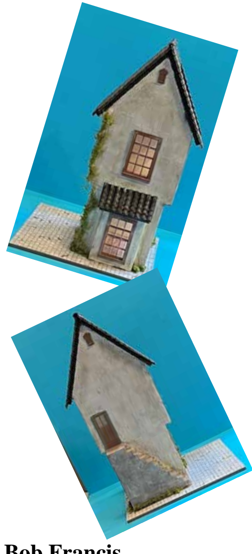
W5-Vignettes - A Quarter Scale Project by Bob Francis Class Fee: $109

Reintroducing "Vignettes – A Quarter Scale Project" from an original design by Suzanne & Andrew's Miniatures. This versatile little 3 floor structure, on a cobblestone base, can be completed as a shop, shop with living quarters, small home...let your imagination soar! We will be constructing the kit, plastering the exterior and painting – no extraordinary skills required beyond the ability to use an Xacto knife, glue & paintbrushes. Just be prepared to have fun and expect some surprises. 5-1/2"L x 5"W x 8"H