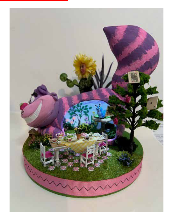
TW1-Tea Party in Wonderland by Linda Farris Class Fee: $169

A 3D printed, lighted Chesire Cat is our host. We will paint his body with pink & purple stripes and paint his inside with clouds, trees & greenery. Polymer clay flowers, leaves & faux plants will be added as well as a mushroom and wise worm that you will paint. A fanciful flower girl looks over her shoulder (polymer clay face you will paint). An outside tree will be decorated with roses and playing cards. You will construct the table for the party and fill it with everything needed. The table and chairs will sit on a polymer clay tile patio. Other plants etc. will be included. A ribbon will finish the edge of the round base. A tiny butterfly will rest on our cat's nose. The kit will come in an 8" x 7" x 7" box that can be used to take your party home in. 7"L x 6'W x 7.5"H