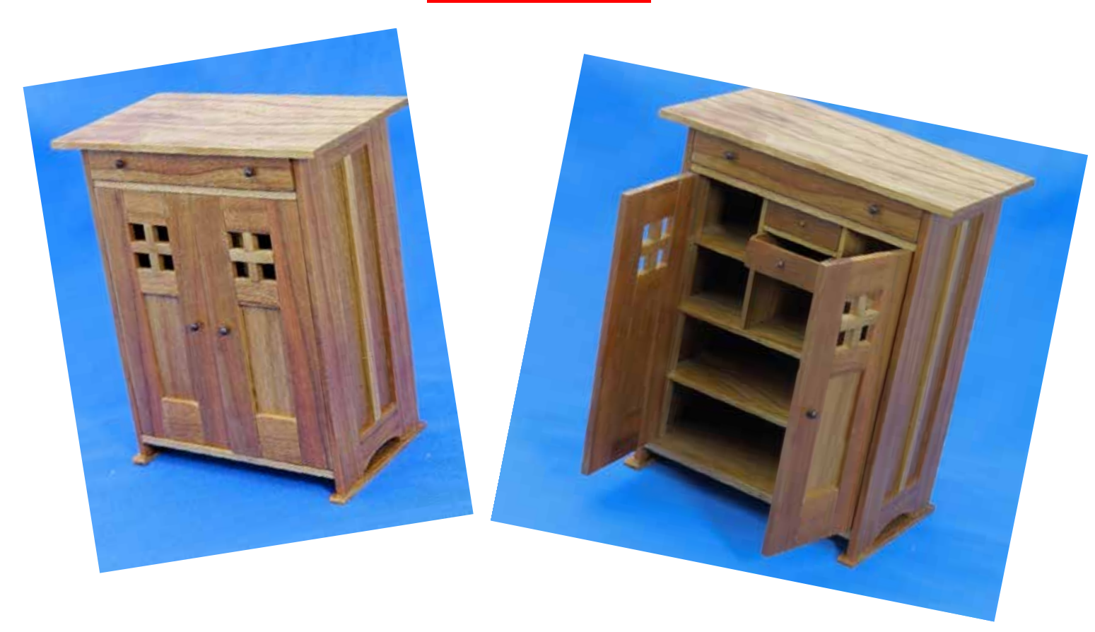
T1-Stickley Man's Dressing Cabinet by Shannon Moore Class Fee: $124

In Gustav Stickley's description of this piece in his early magazine "The Craftsman", he describes this piece as a "convenient object of household use" "which combines the functions usually filled by two or three pieces". The large top drawer was designed for general utility. The small interior drawers held such things as shirt buttons and handkerchiefs. The bottom shelf was for shoes, the one above for trousers. Our version is made of cherry and can be used not only in a bedroom, but anywhere storage is important. The wood will be precut, and our class time will be spent assembling and fine tuning the piece. The piece is approximately: 3-5/8"L x 2-1/8"D x 4-1/4"H