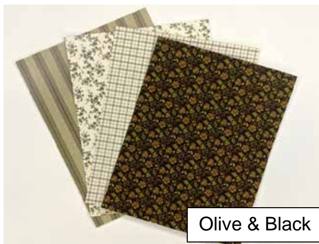
Olive & Black