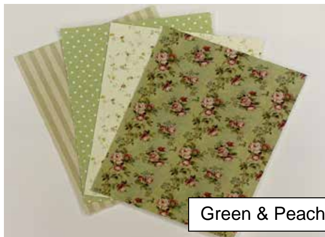
Green & Peach