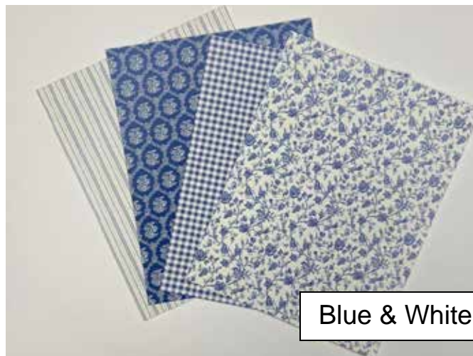
Blue & White

We will have several wallpaper packages in a choice of colors. (Blue & White, Pink & Green, Lavender, Olive & Black, or Green & Peach) to choose from to finish the interior of your project.