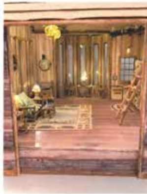
Bailey's Log Cabin