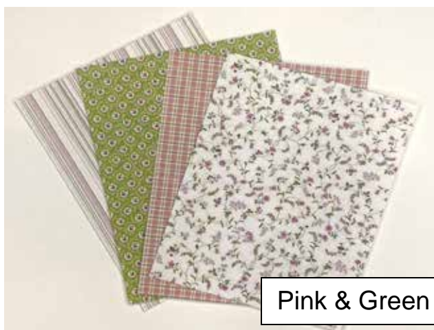
Pink & Green