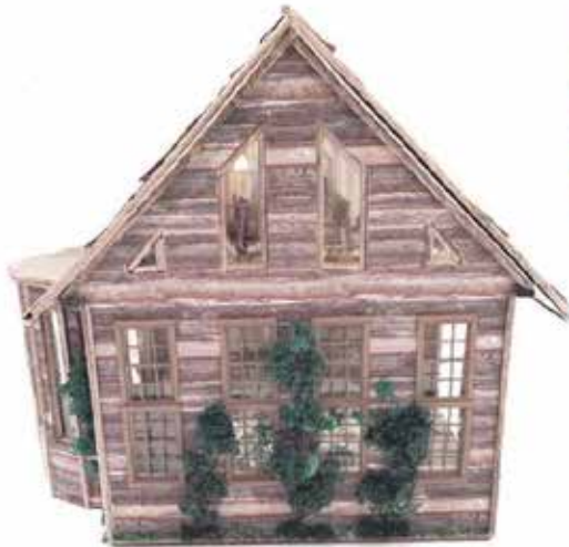
Bailey's Log Cabin