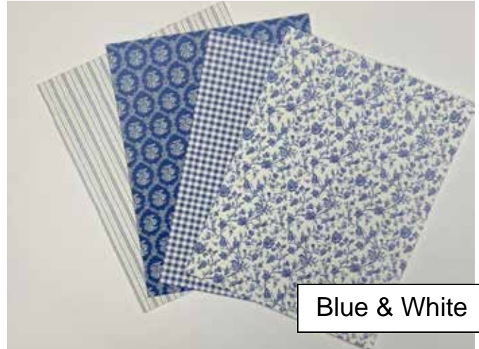
Blue & White

We will have several wallpaper packages in a choice of colors. (Blue & White, Pink & Green, Lavender, Olive & Black, or Green & Peach) to choose from to finish the interior of your project.