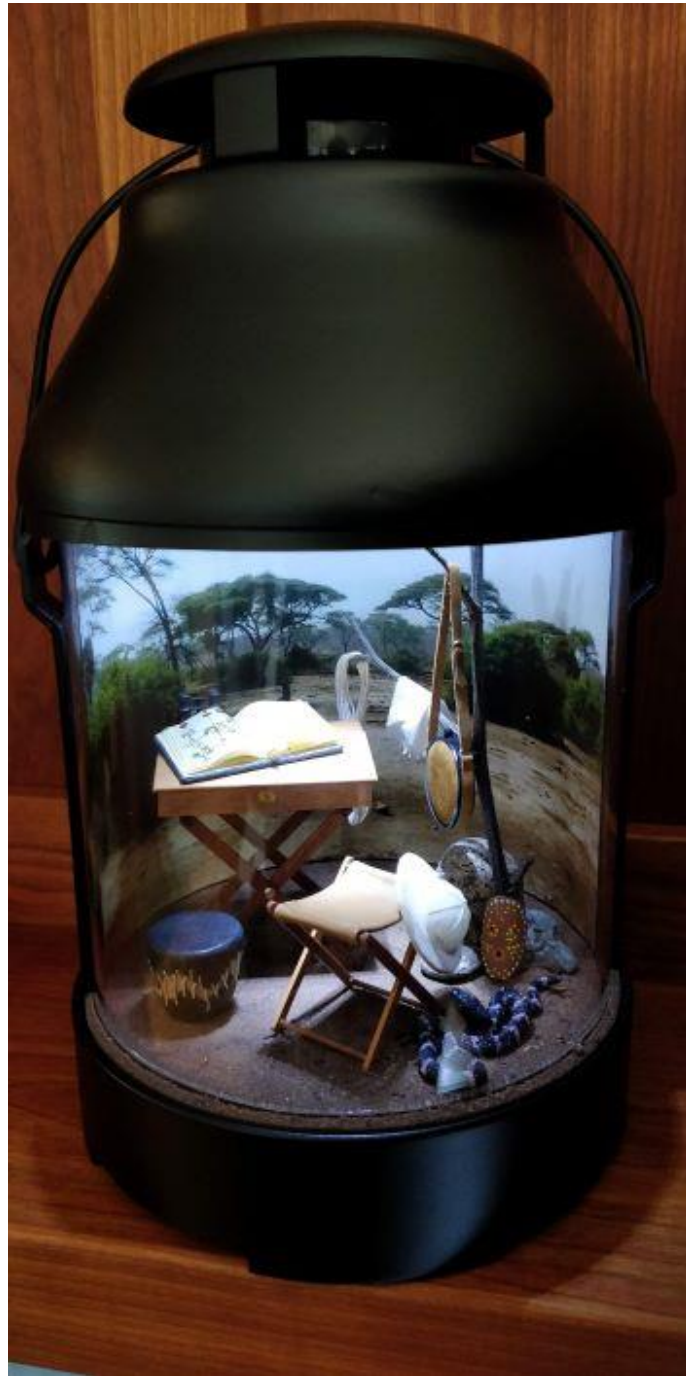
TH4 – African Safari by Ruth Moe Class Fee: $134

We are putting together an African safari scene in a lantern. The inspiration came from my visit to South Africa and the photo I took several years ago. We are making a safari desk and stool, pith helmet, water canteen, open book and African drum and mask. I imagine my occupant as a naturalist. Someone else could have a different vision and tweak the setting in a different direction. The lantern is lit with a small battery powered light at the top. Snack pictured is not included. 7" x 7" x 12"