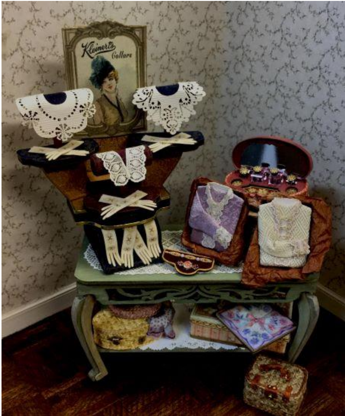
TH3 – A Well Dressed Lady by Lisa Engler Class Fee: $108

A lady looking for stylish attire has a carefully arranged selection to catch her attention. Paper lace collar and trims further embellish the displays. A detailed ladies travel vanity with mirrored back to keep her looking good no matter the destination sits behind the boxed blouses. On the shelf below the table is a boxed hanky assortment with various sizes and shaped boxes to make the display interesting. 4.5" x 2" x 6"