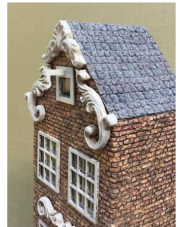
TH1 – Dutch Canal House by Charlotte Atcher Class Fee: $124

Create a charming five floor Dutch house on the edge of an Amsterdam Canal. Bring your own interior paint/wallpaper or see what the instructor brings. Rooms are 2" x 2.5" x 2.25" with scored floors. Imported textured paper will be used on the exterior and cast trim will be painted in class. A basic mini tool kit and palette knife should be brought to class. 5" x 3.5" x 11.25"