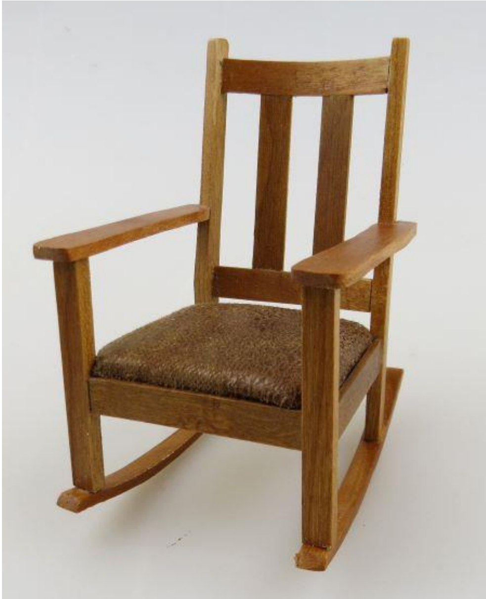
T1 – Mission Rocker by Shannon Moore Class Fee: $99

Minimum Skill Level: All 1/4" scale Tuesday Classes