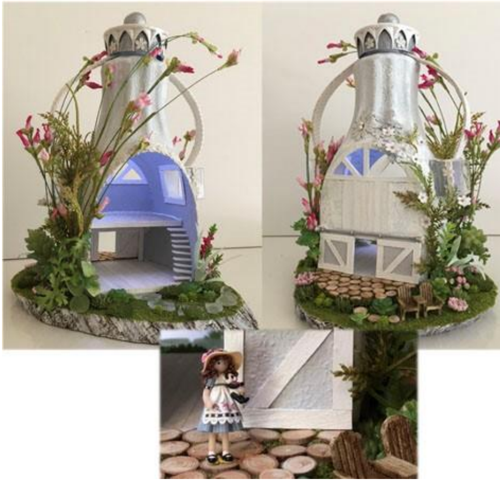
FS1 –Elegant Country Manor by Linda Farris Class Fee: $109

A Wee Forest Family have gone out looking for a new home when they stumble across an old orange juice bottle that some Big Folk have thrown away. Wanting a two-story home for their expanding family, they decide this will do perfectly. First, they have to texture and paint the outside and inside to cover all the stains. Liking lots of light, they decide to make some bay windows to add to the sides. Then they whitewash some old clapboard to use as flooring and outside trim. They have lovely satin geometric fabric for the upper level floor. Knowing that sliding barn doors are all the rage they now make some of the back of their new home, which leads to a beautiful log round patio. Landscaping is their thing, so they make use of the big fold plants and flowers for their yard and drag in some sea glass pieces to create a walkway. Adding some whimsical floral trim to the outside of their manor turns out to be just the thing. As a final touch they add battery operated lights in the attic to shine down into the rooms. They already have some lawn chairs and one of the Wee Family's adorable little girls is staying to help decorate the Elegant Country Manor. 9-1/2" W x 7-1/2" D x 11" H