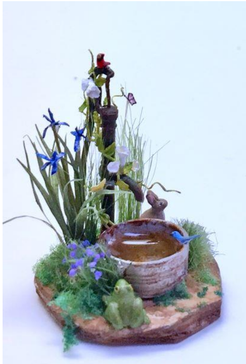
F2 – Nature's Neighbors by Sally Manwell Class Fee: $79

You will make the wild iris out of another laser cut flower with trimming. Wind the stems of the morning glory around the hand pump that you have weathered, then make tendrils, leaves and the morning glory flowers. Then add some grasses and plants that can be purchased from train stores. You will weather the tub and fill it with a UV resin. Add some butterflies and birds and animals from Barbara Ann Meyer to finish the neighborhood scene. 1" x 1" x 2"