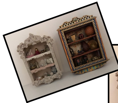
F7 - Shelves: Shabby Sweet & Country Chic by Ginger Landon-Siegel 1" Scale • $59