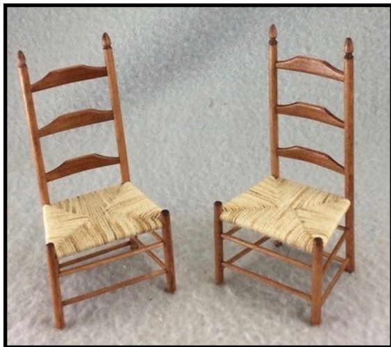
F4 - Country Ladderback Chairs by Pam Boorum 1" Scale • $74