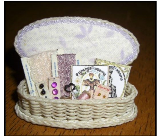
F5- Table Top Wicker Sewing Basket by Joan Purcell 1" Scale • $54