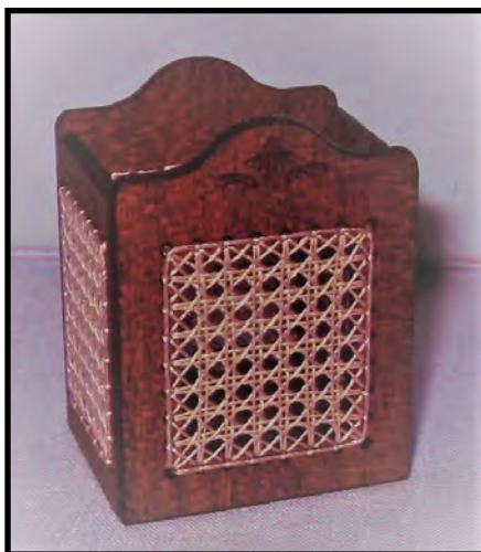
F6 - Caned Magazine Rack by Sue Ann Ketchum 1" Scale • $49