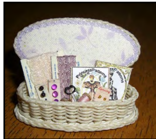
F5- Table Top Wicker Sewing Basket by Joan Purcell 1" Scale • $54