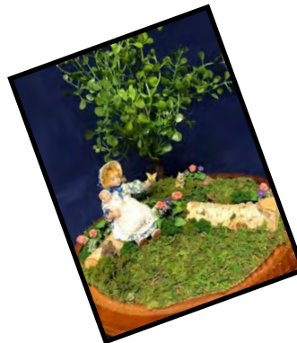
W5 - 3-1/2" Pearl Playing With Butterflies by Pat Boldt 1" Scale • $178