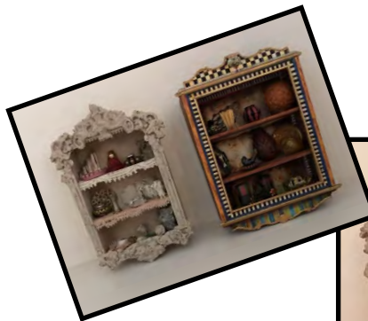
F7 - Shelves: Shabby Sweet & Country Chic by Ginger Landon-Siegel 1" Scale • $59