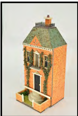
T4 - Madeline's Little French House by Sue Herber 1/4" Scale • $139