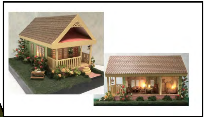
TW2 - Just Peachy By Kristie Norman 1/4" Scale • $189

1-Day Workshop • Wednesday 8:00 a.m. - 5:00 p.m.