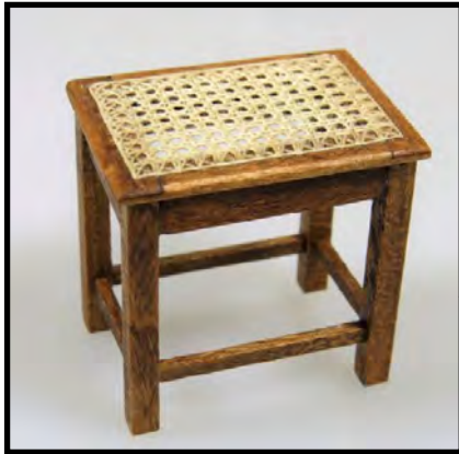
W1 - Caned Stool by Shannon Moore 1" Scale • $94

1-Day Workshop • Wednesday 8:00 a.m. - 5:00 p.m.