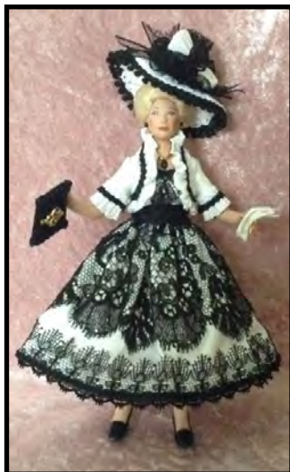
W4 - Definitely Not Shabby by JoAnne Roberts 1" Scale • $164