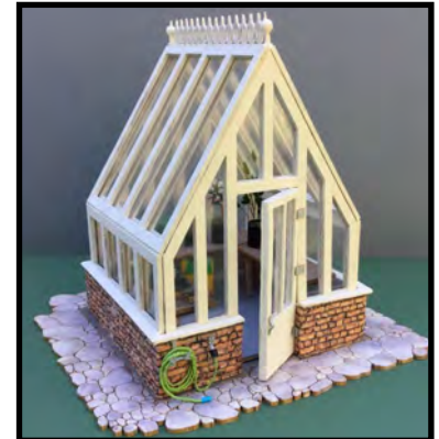
W3 - Country Green House by Charlotte Atcher 1/4" Scale • $74