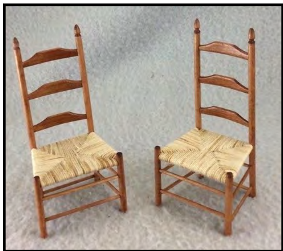
F4 - Country Ladderback Chairs by Pam Boorum 1" Scale • $74