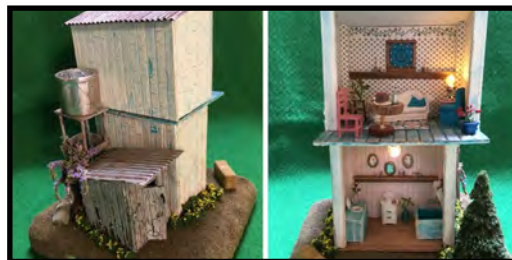
T5 - The Necessary by Donna Brewington 1/4" Scale • $75