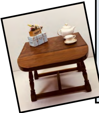
TH4 - A Country Flower Arrangement by Sally Manwell 1" or 1/4" Scale • $59