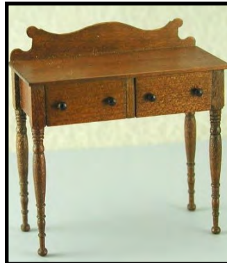
W2 - Tennessee Dressing Table by Pete Boorum 1" Scale • $104