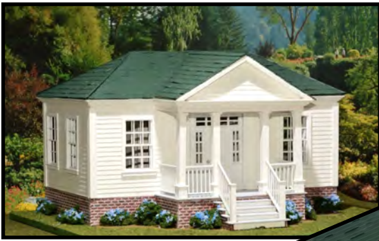
TW1 - 1/4" Southern Cottage by Debbie Young 1/4" Scale • $169

2-Day Workshop • Tuesday & Wednesday 8:00 a.m. - 5:00 p.m.