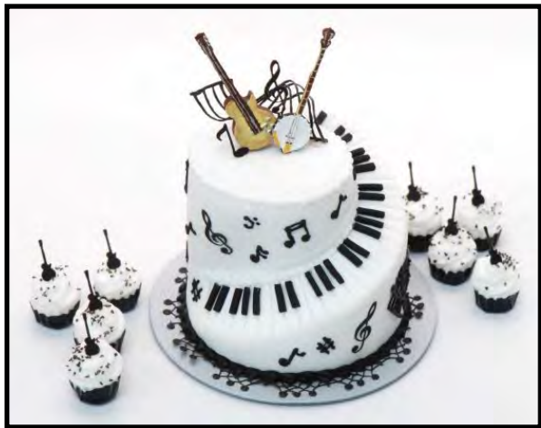
F1 - Taste of Country by Ruth Stewart 1" Scale • $87

1-Day Workshop • Friday 7:30 a.m. - 11:30 a.m.