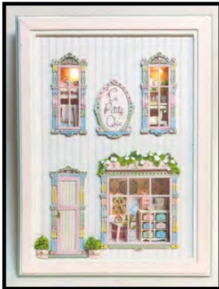
T1 - La Petite Chic Shop Window by Robin & Shawn Betterley 1/4" Scale • $109

1-Day Workshop • Tuesday • 8:00 a.m. - 5:00 p.m.