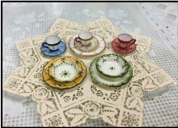
TH3 - Elegant Dishes by Lisa Engler 1" Scale • $79