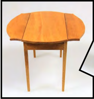
M1 - Pembroke Table by Shannon Moore 1" Scale • $104

1-Day Workshop • Monday 8:00 a.m. - 5:00 p.m.