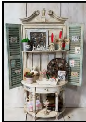
T2 - Faux Finish Vignette by Angelika Oeckl 1" Scale • $113