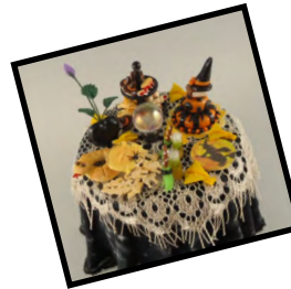
T3 - A Witches' Tea Party by Donna Eckel 1" Scale • $84