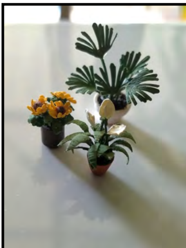
TH5 - 1/4" Southern Accent Plants by Charrita Teague 1/4" Scale • $35