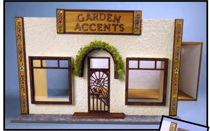
TH2 - Garden Accents Shop by Karen Benson 1/4" Scale • $89