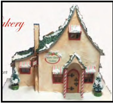
MT1 - Clara Claus Bakery by Cat Wingler 1/4" Scale • $139

2-Day Workshop • Monday & Tuesday • 8:00 a.m. - 5:00 p.m.