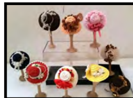
S2 - A Special Hat for the Derby Day by Jean Ellsworth 1" scale • $44