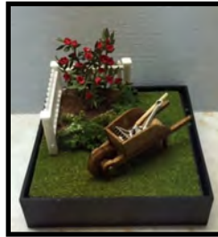
F2 - Garden Roses by Sally Manwell 1/4" scale • $49