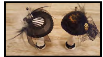
F3 - It's All About the Hat by Jenny Yates 1" scale • $39