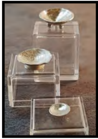
F1 - Fine Silver Bowls by Marti Icenogle 1" scale • $54