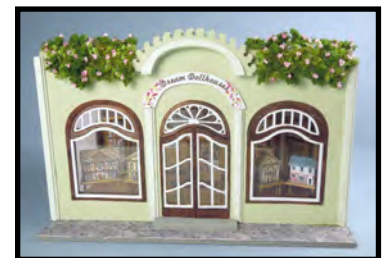
S3 - Dream Dollhouses Shop by Karen Benson 1/4" scale • $89