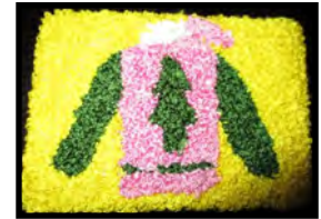
F6 - Punch Needle Rug by Vicki Dukes 1" scale • $60