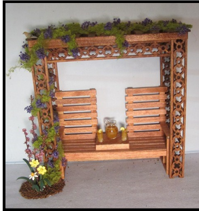
F2 - Bench with Pergola by Sue Ann Ketchum 1" or 1/2" Scale • $114