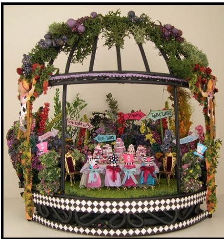
W4 - Mad Hatter's Tea Party by Ginger Landon-Siegel 1/4" Scale • $92