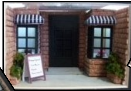
F8 - Today's Special by Cat Winger & Jackie Batcheller 1/4" Scale • $74