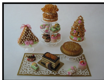
MT2 - French Pastry by Carl Bronsdon 1" scale • $149