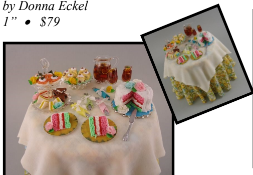
T1 - Tea Party in the Garden by Donna Eckel 1" • $79