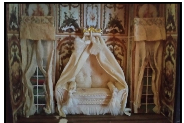
W7 - French Sitting Nook by Barbara Wilson 1/4" Scale • $89