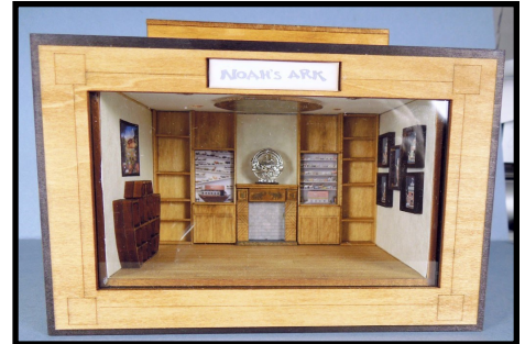
TH2 - Noah's Ark Frame & Room Box by Karen Benson 1/4" scale • $99