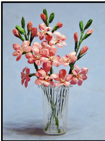
TH5 - 1" Gladiolus Stems in a Vase by Susan Karatjas 1" scale • $59