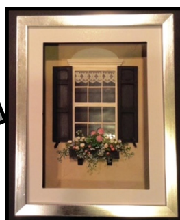
T2 - Framed Window Box Vignette by Sandra Whipple 1" • $64