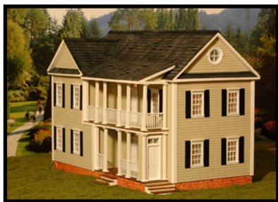
MTW1 - 1/4" Charleston Single by Debbie Young 1/4" scale • $289