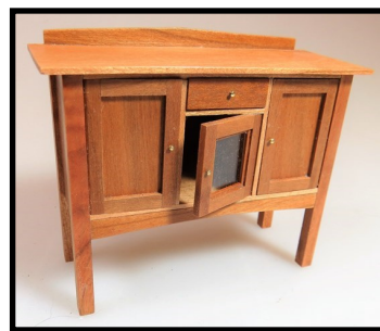
M1 - Mission Sideboard by Shannon Moore 1" scale • $104