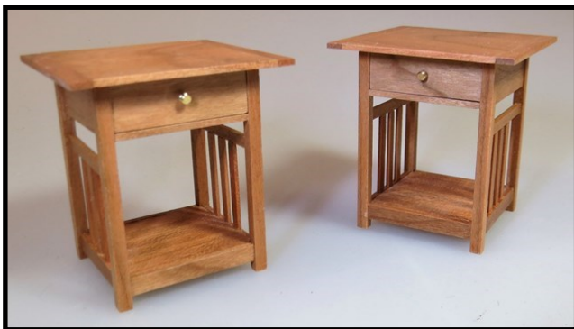
F7 - Pair of Mission Side Tables by Shannon Moore 1" Scale • $79