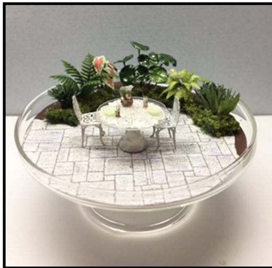
F5 - Tea in the Garden by Sally Manwell 1/4" Scale • $69