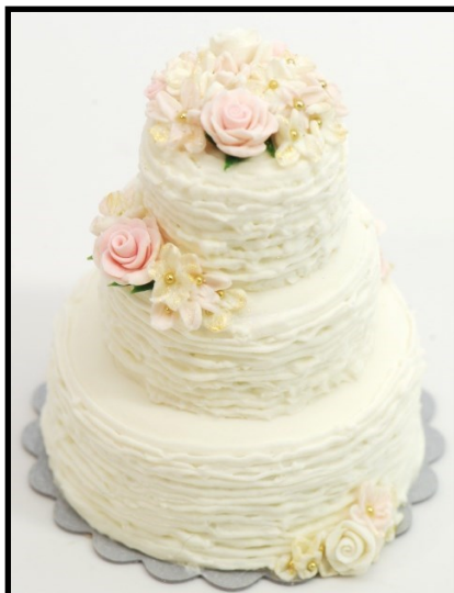
W6 - Frills and Frosting by Ruth Stewart 1" Scale • $81