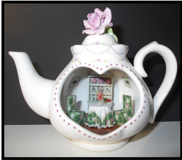
TH1 - 1/4" Scale Dining Room in a Teapot by Ginger Anderson 1/4" scale • $64

1-Day Workshop • Thursday • 7:45 a.m. - 11:30 a.m.