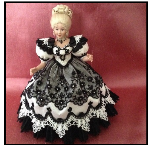
W5 - Southern Belle in White & Black by JoAnne Roberts 1" Scale • $164