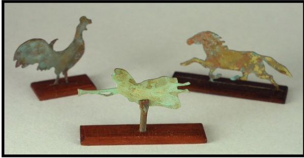
F1 - Wind Vanes by Pam Boorum 1" Scale • $74

I-Day Workshop • Friday 7:30 a.m. - 11:30 a.m.