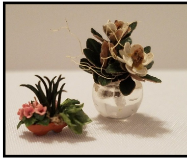
TH3 - Dish Garden and Magnolia Arrangement by Charrita Teague 1/4" scale • $24