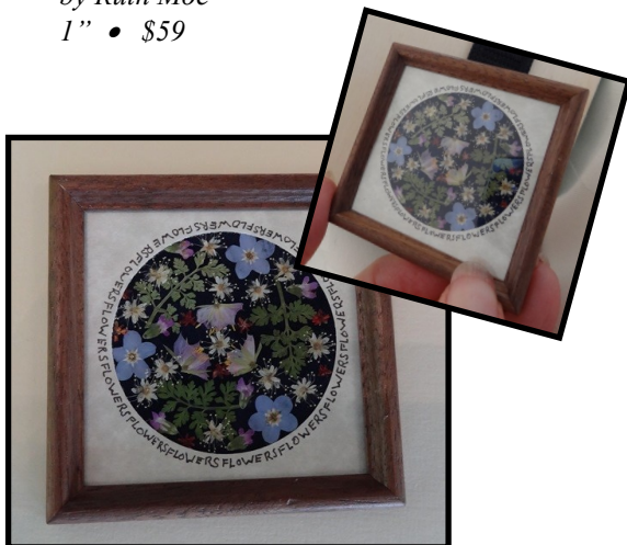
TH7 - Pressed Flower Picture by Ruth Moe 1" • $59