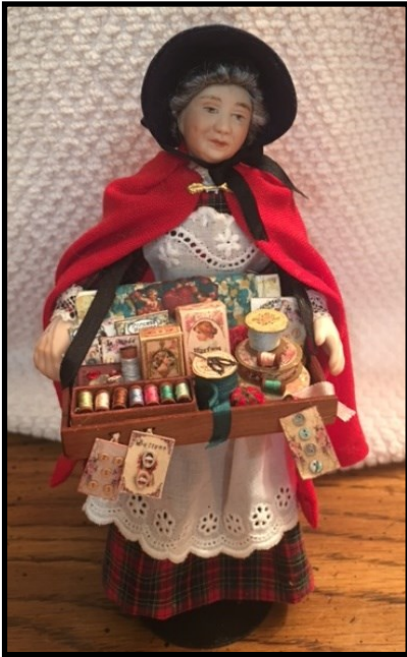
W1 - Peddler Doll by Pat Boldt 1" Scale • $149

1-Day Workshop • Wednesday 8:00 a.m. - 5:00 p.m.