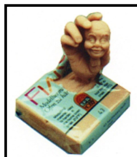
MT3 - Sculpting for the Feebled Fingered by Cat Wingler 1" or 1/2" scale • $139