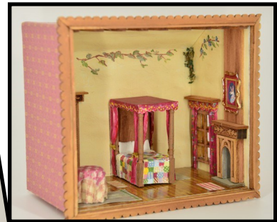
TH4 - English Country Mouse Bedroom by Sue Herber 1/4" scale • $99