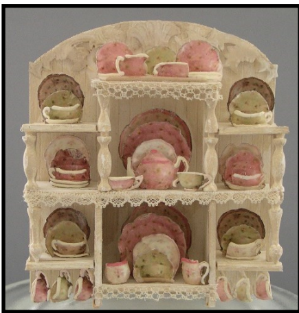
F4 - Shabby Chic Tea Shelf by Ginger Landon-Siegel 1" Scale • $52