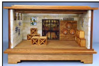
TH2 - Wine Tasting Room by Karen Benson 1/4" scale • $89