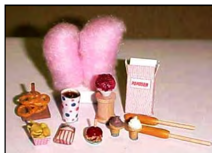
TH3 - Circus Treats by Carolyn Eiche 1" scale • $46