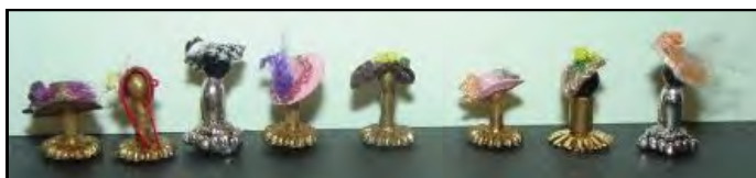
TH11 - Hats in Quarter Inch Scale by Rachelle Spiegel 1/4" • $49