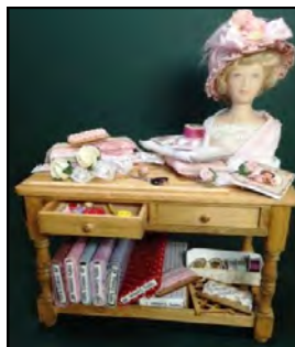
TH5 - Millinery Delight by Deb Laue 1" scale • $100