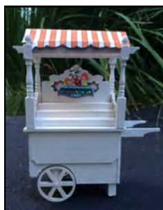
TH8 - Market Cart by Connie Reagan 1/2" or 1" • $79