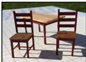
TH7 - Country Table & Chairs in Half Scale by Ann Pennypacker 1/2" • $39