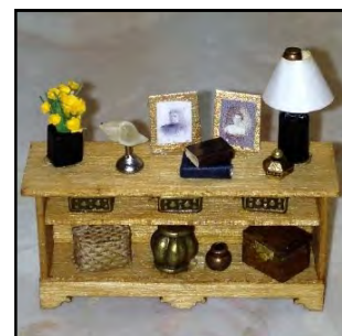
TH6 - 1/4" Scale Accessories by Sally Manwell 1/4" • $49