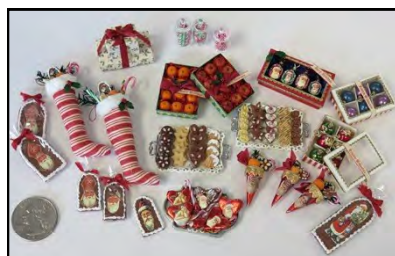
TW1 - Christmas Trimmings by Carl Bronsdon 1" • $179

2-Day Workshop • Tuesday & Wednesday 8:00 a.m. - 5:00 p.m.