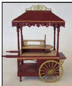
M1 - Old World Peddlers Cart by Carl Bronsdon 1" • $109

1-Day Workshop • Monday 8:00 a.m. - 5:00 p.m.