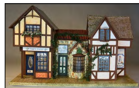
TW2 - 1/4" Beatrix Potter's Village by Sue Herber 1/4" • $209