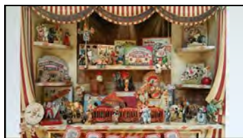
MT1 - Circus Vignette by Angelika Oeckl 1" scale • $164