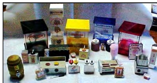
M2 - Concession Stand Machines by Carolyn Eiche 1" scale • $114

1-Day Workshop • Tuesday 8:00 a.m. - 5:00 p.m.