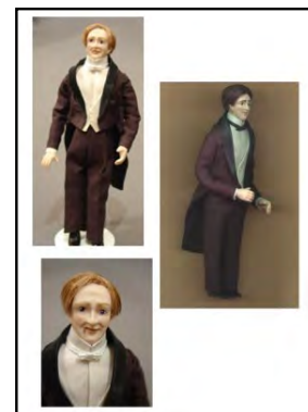
T3 - A Gentleman in Formal Tails by Rachelle Spiegel 1" • $119