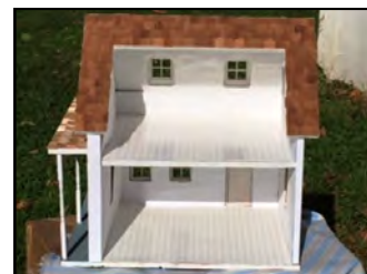
MT2 - Half Scale Cottage by Ann Pennypacker 1/2" scale • $109

1-Day Workshop • Monday 8:00 a.m. - 5:00 p.m.