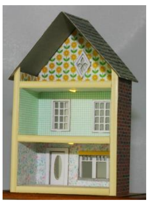
TH1 – 1/144" Brick Dollhouse