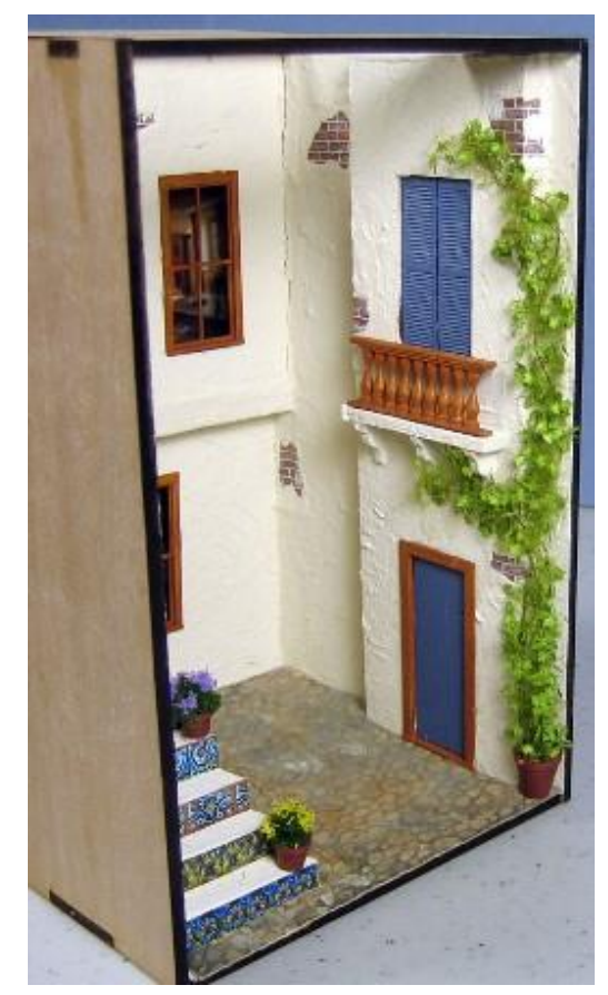
TH2 – Tuscany Courtyard by Karen Benson Class Fee: $122

WOW! A little corner of Tuscany to call your own. Build this courtyard where you can escape to have a quiet moment. The courtyard is built into a 5" x 7" frame; the scene itself is 3-1/2"w x 5-1/2"h x 4"d (not including the frame). No light is required because there is an acrylic covered opening in the top. However, an optional LED kit will be available if you would like to light the two interior rooms. The interior scene slides out of the back of the frame for easy access. This is a wood laser cut kit & you will build the exterior box & interior scene and then stucco the walls, paint the trims, & finish the stairs with "Italian tile." There's plenty of room in the courtyard to add more plants, flowers, a table for two, or maybe a lazy cat and/or dog from your own stash of accessories.