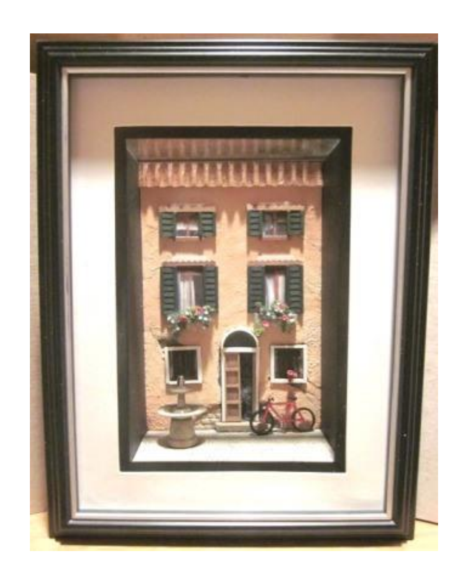
TH9 - Framed Tuscan Courtyard Vignette