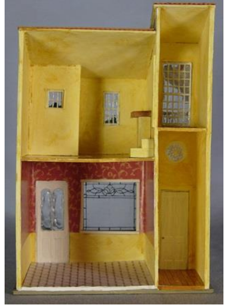
TH5 – Café Michel by Sue Herber Class Fee: $132

Café Michel is a small Mediterranean building with crumbling plaster over stone construction. A little cafe with overhanging cover fills most of the first floor. There is a separate entry to the side leading to a second floor apartment with a tiled roof, several balconies, flower boxes, and even wash hanging on the line. A small fireplace keeps the apartment warm. Learn not only how to build this café, but also how to age it for an authentic look.