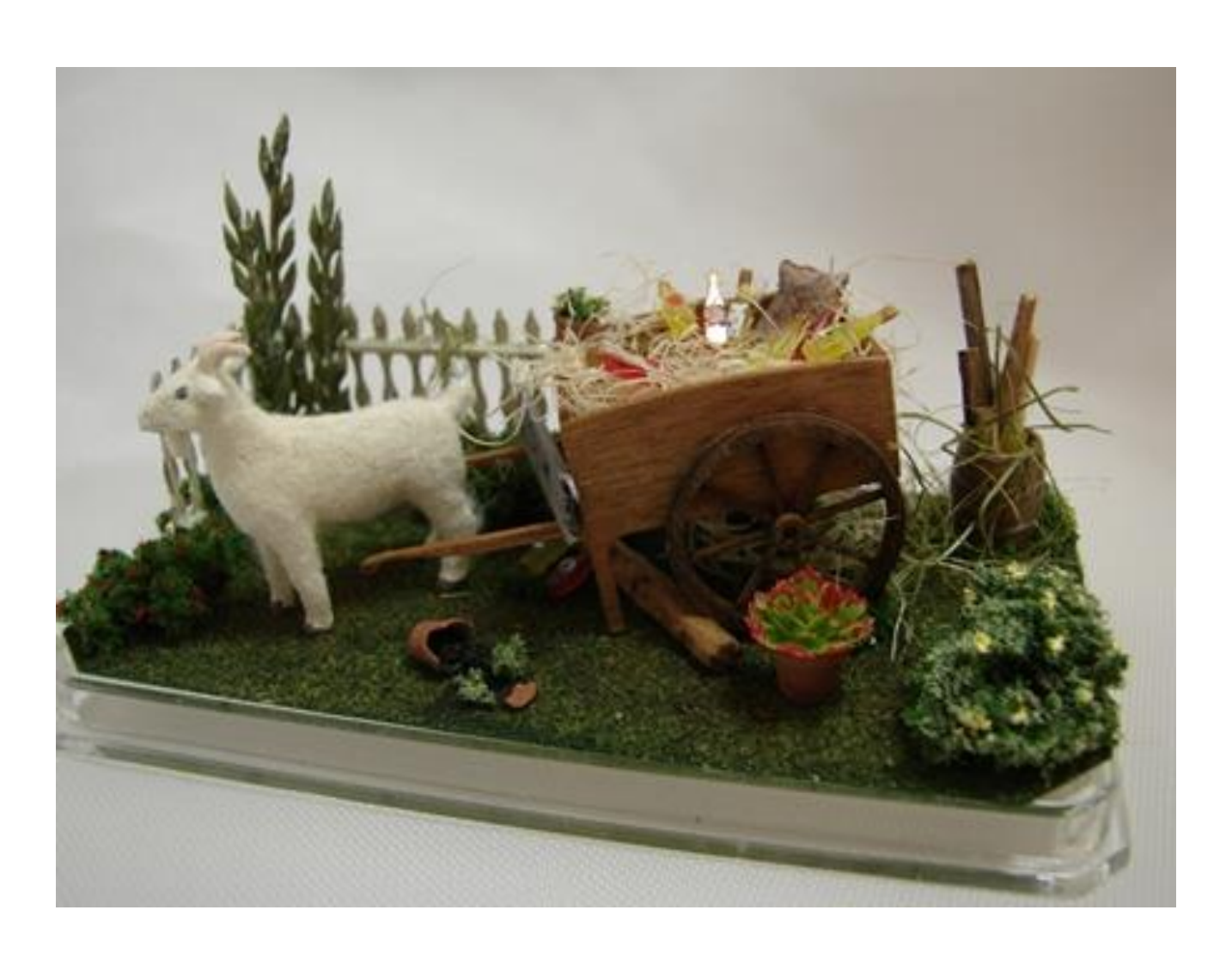
TH3 – Goat Cart by Jo Dewane Class Fee: $87

Create this Tuscan-looking scene which fits into the 3-1/2" x 2" x 2" clear container (included). You'll assemble the cart & make several accessories. Then, you can arrange the cart & the goat (by Barbara Myer), with the rest of the provided accessories and landscaping materials into your own unique vignette. Take home a finished project along with tips & techniques to use in other projects....all while having fun!