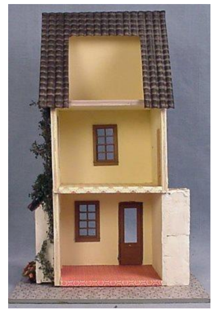
TH7 – "Vignette's" by Suzanne Larson-Tamburo Class Fee: $84

"Vignette's" is a little three-story Tuscan shop with an outside stairway leading to the second floor. Students will build & finish the structure & learn how to use joint compound to make stonework. This is the last structure introduced in 2014 of a three part series that, when placed together, form a cobblestoned town center. Each structure can/will stand on its own, however.