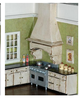
TH11 – 1/4" Tuscan Kitchen by Debbie Young Class Fee: $107

Capture the rustic, warm, & inviting spirit of Italy in this lovely framed Tuscan Kitchen. This spacious kitchen features antiqued cabinets, warm wood floors, a large center island, a Viking stove with a beautiful hood, & a mural of the Italian countryside. All pictured accessories are included (paintings, canister set, pans, bottles, sunflowers). Instructor will provide all paints, glues, & assorted supplies as well as cutting boards, paper towels, wax paper, etc. Students only need to bring a very basic tool kit–xacto knife, extra blades, cork back ruler, scissors, tweezers, & assortment of paintbrushes (for Yes glue, house paint, & detail work).